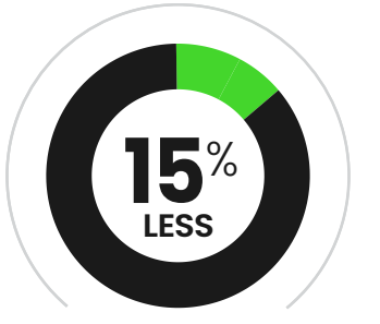
Digital delivery will reduce change orders by <u>15%</u> – a significant financial benefit.<sup>1</sup>