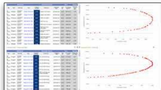
Fig. 2 – In order to maintain flow, Cairn monitors cost benefit analysis of individual stimulation treatments of all wells to identify underperforming assets.

usually entails numerous stakeholders, voluminous data, and multiple interfaces. With data dispersed among various interfaces and disparate sources, Cairn faced a lack of data visibility and accuracy, which are crucial for decision-making. To implement its SWIM, Cairn relied on Bentley's AssetWise to establish a connected data environment. The single platform streamlined workflows and converted all processes to a digital format. The interoperability of AssetWise provided a digital solution that interfaced with Cairn's internal, web-based portal and integrated data from different sources within Cairn.