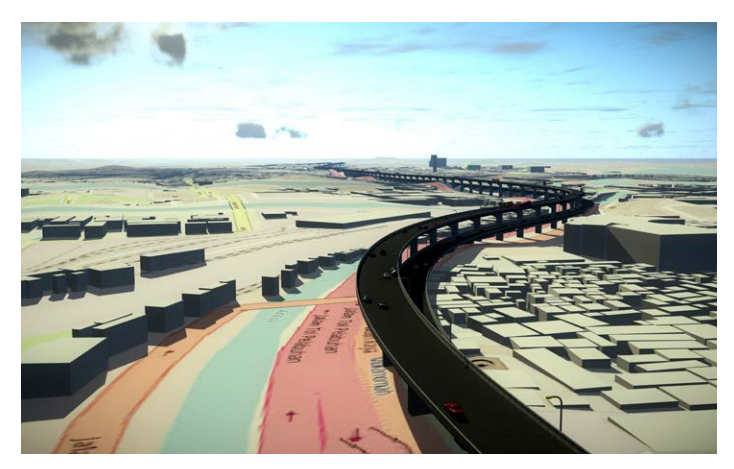
OpenRoads helped WIKA review the alignment of the main road, ramps, and approaching structures.

Though WIKA projected the design of Harbour Road 2 would take seven months using traditional 2D survey and design methods, its decision to switch to a BIM methodology helped the project team complete the design in only four months. When construction is completed, an estimated 63,500 vehicles will cross the new toll road each day, which will speed economic and tourism development in the area and facilitate access to the U-20 World Cup matches. Combined with the cost savings gained through design efficiencies, the government expects Harbour Road 2 to pay for itself by 2032, or three years earlier than anticipated.