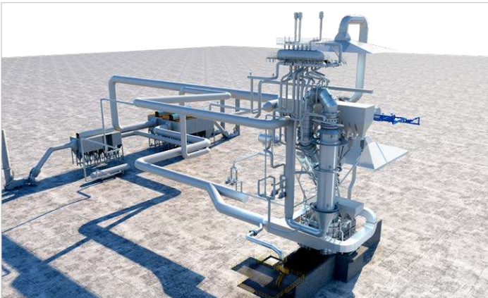
Construction simulation in SYNCHRO ensured the steelmaking plant’s complex structural arrangement was constructed safely and quickly to save CNY 1.8 million.

Using Bentley applications, WISDRI saved 300 hours of communication time to lift design efficiency by 30% and cut design time by 45 days. The digital solutions supported simultaneous engineering work among 15 separate design disciplines to avoid 166 major collision points on the Quwo steel plant. Moreover, simulating construction in SYNCHRO removed 60 days from the construction timeline to save CNY 1.8 million on the project. Most importantly to the client, using the modeling software to quantify carbon dioxide release lowered the plant’s carbon emissions by 0.1 ton per every ton of steel to achieve the energy conservation requirements on this project. Conquering so many obstacles and building a cost-efficient, sustainable steel plant that contains intelligent, cutting-edge technology, WISDRI is now a new leader in applying digital solutions in the metallurgical field.