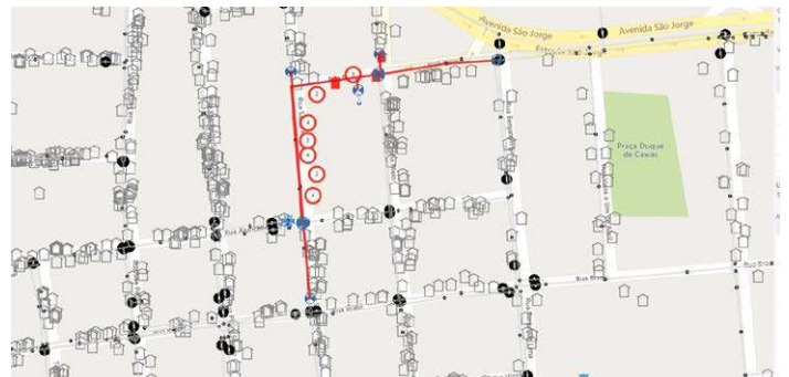
OpenFlows WaterSight helped AEGEA improve operational workflows to determine how to best manage their operations.