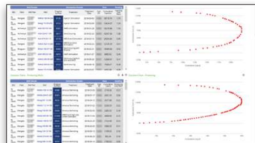
Fig. 2 – In order to maintain flow, Cairn monitors cost benefit analysis of individual stimulation treatments of all wells to identify underperforming assets.

usually entails numerous stakeholders, voluminous data, and multiple interfaces. With data dispersed among various interfaces and disparate sources, Cairn faced a lack of data visibility and accuracy, which are crucial for decision-making. To implement its SWIM, Cairn relied on Bentley's AssetWise to establish a connected data environment. The single platform streamlined workflows and converted all processes to a digital format. The interoperability of AssetWise provided a digital solution that interfaced with Cairn's internal, web-based portal and integrated data from different sources within Cairn.