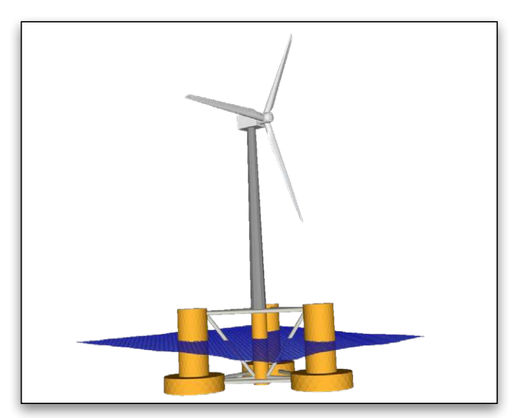
Floating semi-submersible wind turbine platform in MOSES.

The Femap interface allows you to model transition or component pieces and other complex geometries in Femap and import them into SACS and MOSES.