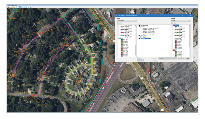
For brownfield or greenfield designs, OpenComms Designer supports fiber, coax, and hybrid fiber coax network projects.

OpenComms Designer enables you to improve efficiency and increase engineering throughput of infrastructure design by merging network design and work management in a single environment. For outside plant networks, you can quickly lay out and verify coax, FTTx, HFC, and other architectures in a rich engineering GIS that includes the precision of MicroStation® with interactive signal calculations.