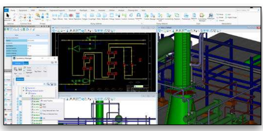
2D/3D model integration enhances project accuracy.