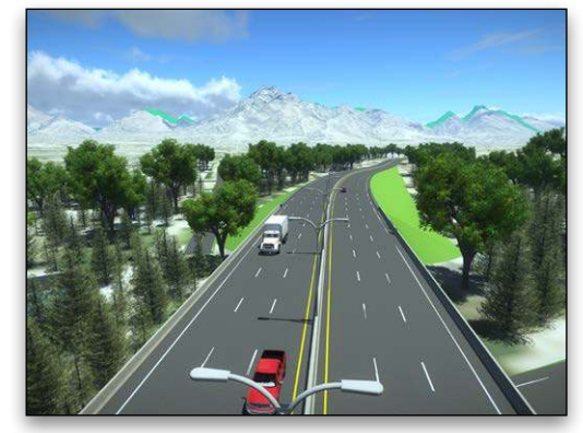
Create stunning photo-realistic visualizations in seconds using dynamic immersive visualization capabilities.