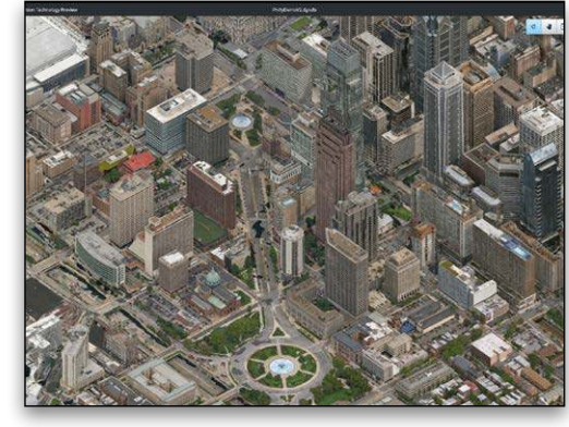
You can easily import a wide range of data including terrain models, raster DEMs, images, GIS, reality meshes, and more to create intelligent 3D models.