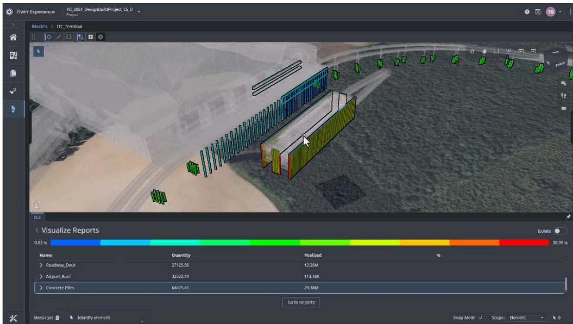
Example of Bentley's Carbon Analysis capabilities: Embodied carbon visualization in an airport design